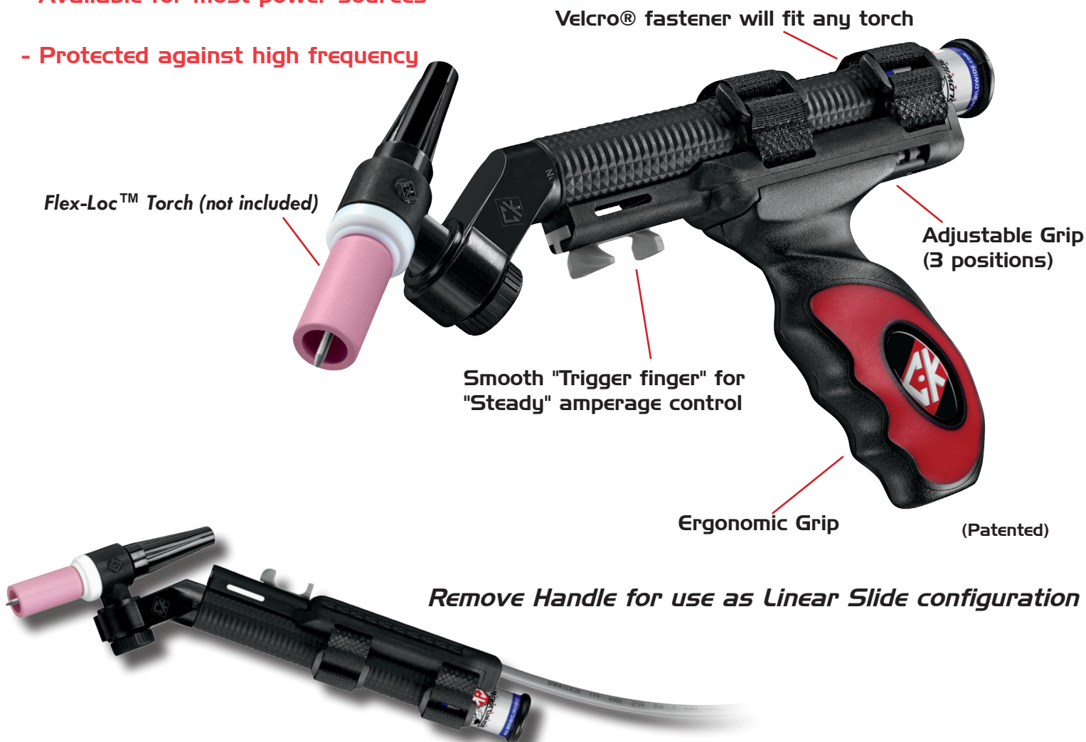
Flex-Loc™ Torch (not included)